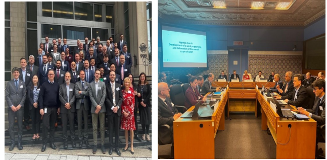
ICAO Advanced Air Mobility Study Group (AAM SG)

During the first week of May, Members across 15 States and 16 International Organizations came together in Montreal for the inaugural session of the ICAO AAM Study Group. The first session focused on reviewing and aligning on the Study Group objectives, coordination within ICAO, and the formation of three complementary Working Groups (WGs) targeting key objectives put in place by the Assembly: AAM Vision WG , Small UAS & UTM Guidance Material WG , and Exploratory WG .